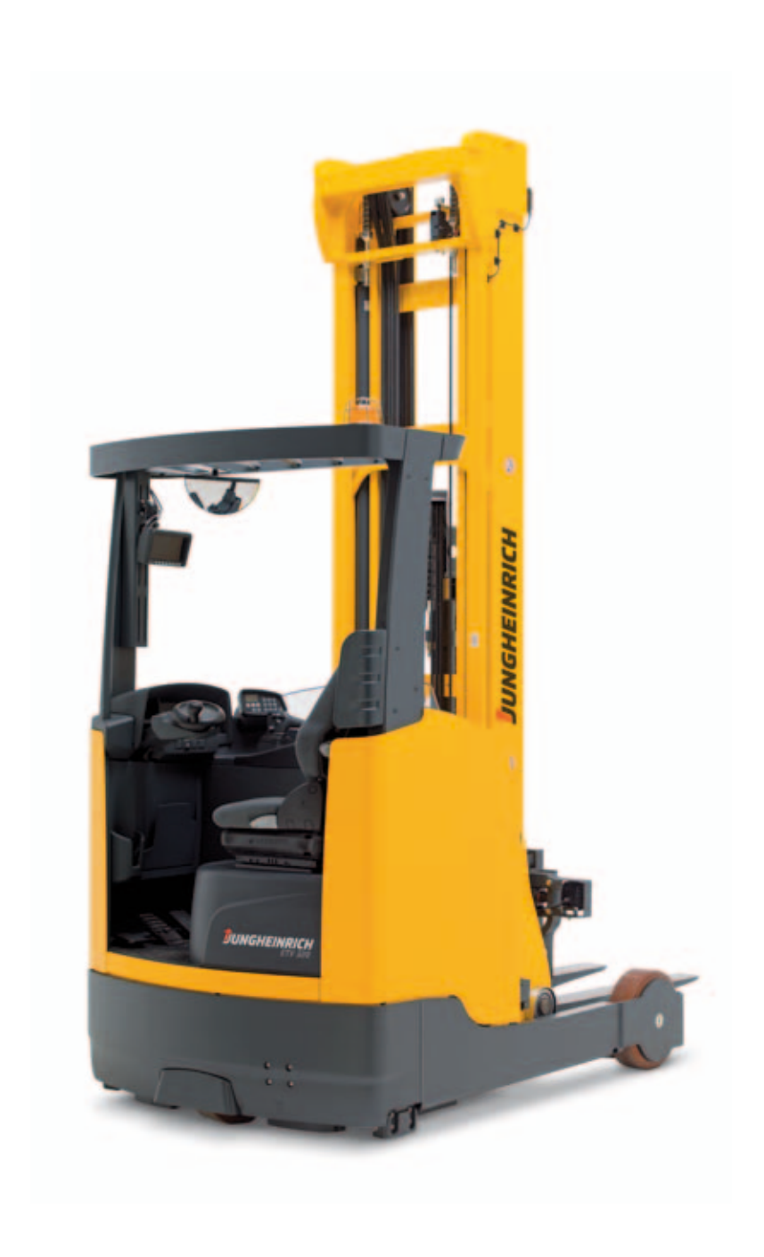
Series 3 Lifting the heaviest loads to the greatest heights