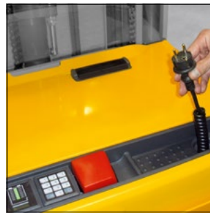
Integrated charger for convenient and, when required, quick charging of the battery at any mains socket