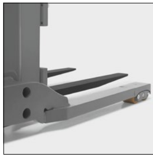
Support arm with patented tandem load wheels