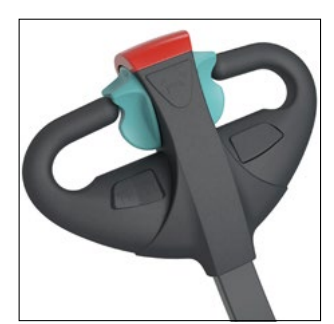
Ergonomic designed tiller head