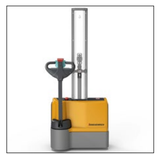
Compact design for use in confined spaces