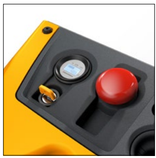
Centralized control instruments