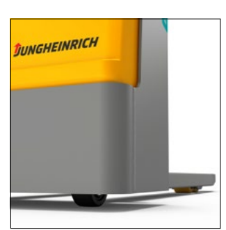
High level of safety due to low ground clearance