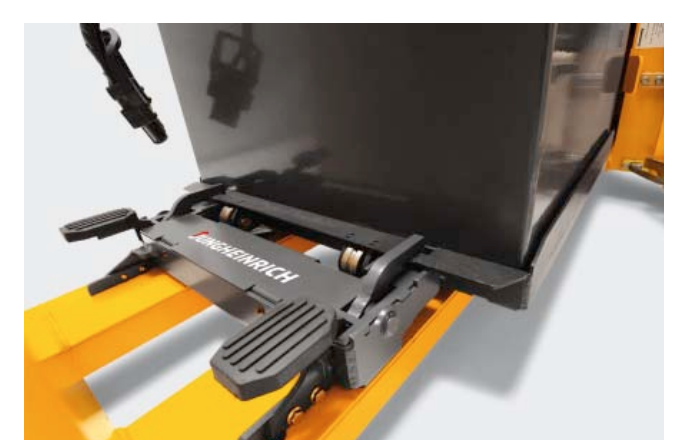
Two side foot notches to open/close the connection with the battery trolley.