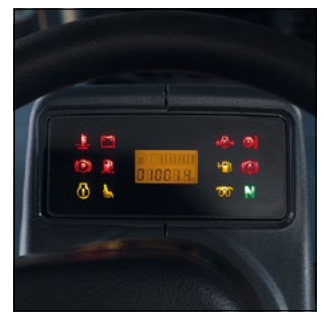
Display in the operator's field of vision