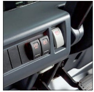
Electrically applied parking brake, easily operated at the push of a