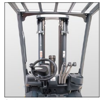
Optimum view of the load thanks to lift mast design giving ideal visibility.