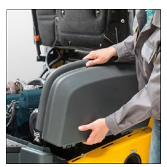
Side sections are easily detachable without tools.