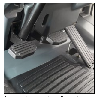
Automotive pedal configuration with non-slip surface.