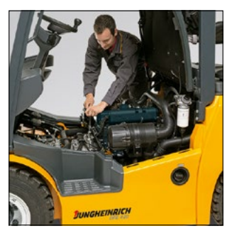
Simple, fast and affordable main-