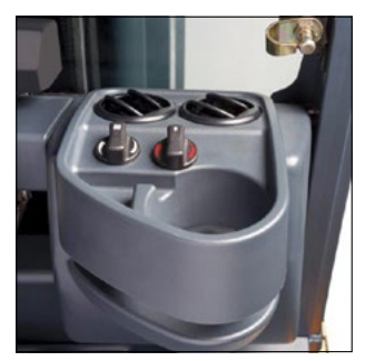
Heating including air demister for windscreen